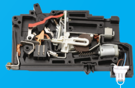
plugs in - no extra wiring

Built-in scheduling program with astronomical clock and up to 84 available schedules